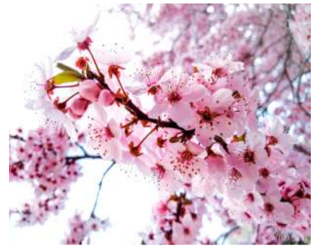
It is finally Spring!!!

The farmers are in the fields sowing seeds where its dry (love all the moisture) and